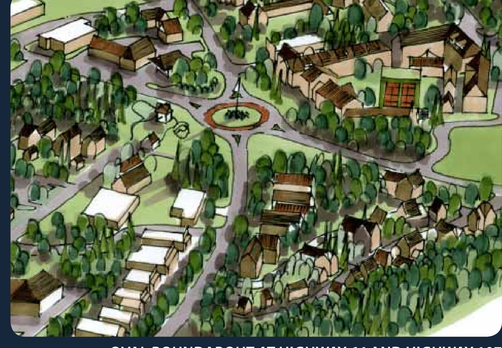
OVAL ROUNDABOUT AT HIGHWAY 64 AND HIGHWAY 107